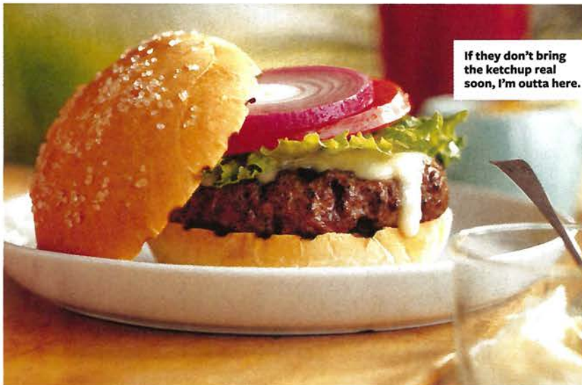
If they don't bring the ketchup real soon, I'm outta here.